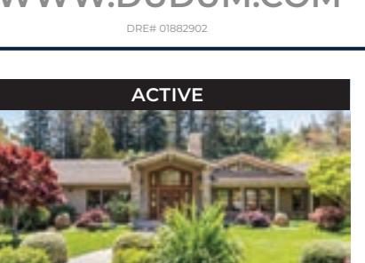
4067 HAPPY VALLEY ROAD, LAFAYETTE OFFERED AT $8,625,000 J. DEL SANTO / T. FRECHMAN | 925,915,0851